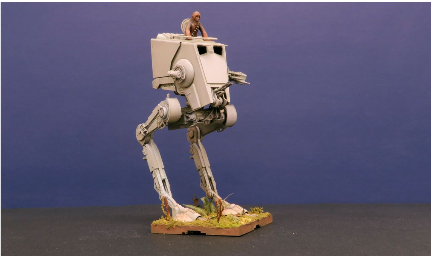
Tom Boisvert's 1:48 scale Star Wars AT-ST Imperial Scout Walker (Bandai) The model was built OOB and painted with Tamiya acrylics.