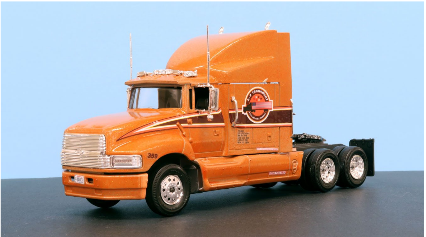
Bart Navarro's 1:32 scale Ford Aeromax semi tractor (Revell Snap-Tite), built OOB and painted with craft acrylics and Rustoleum clear gloss.