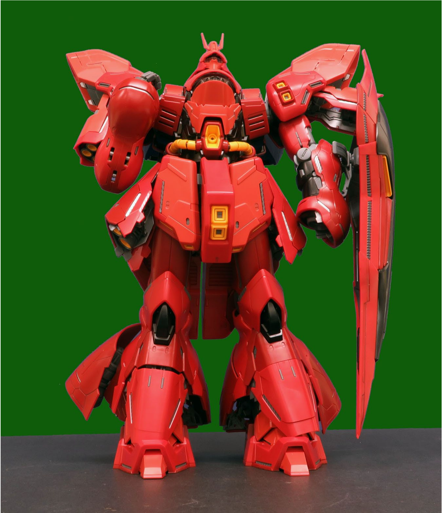
Lars Knowles's Sazabi Version KA Gundam. The MSN-04 Sazabi appears in Mobile Suit Gundam: Char's Counterattack . It is piloted by Char Aznable. With an overall height of 25.6 meters, the Sazabi is much bigger than most standard mobile suits, but thanks to the use of lightweight armor materials and a great number of thrusters it is much faster and maneuverable. The suit is armed with an abdomen-mounted scattering mega particle cannon, a beam shot rifle, a pair of beam sabers stored in the arms, and a shield with three missiles as well as a beam tomahawk.